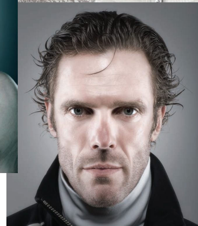
Mario Cipollini Solvang, California Feb. '07