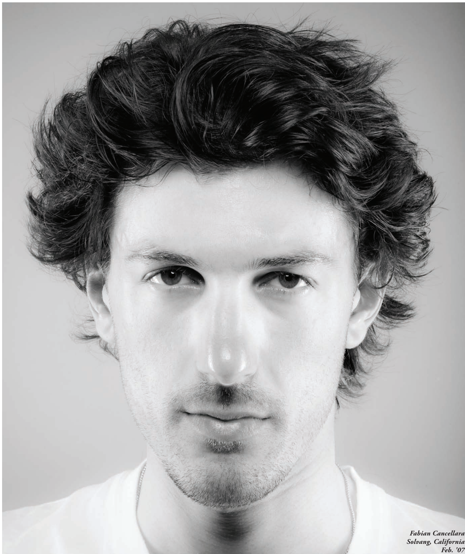
Fabian Cancellara Solvang, California Feb. '07

ROAD Magazine's oversized format, heavy paper and generous features well have always appealed to me as a photographer. I first noticed it about 10 years ago and was soon doing portraits for ROAD on a regular basis.