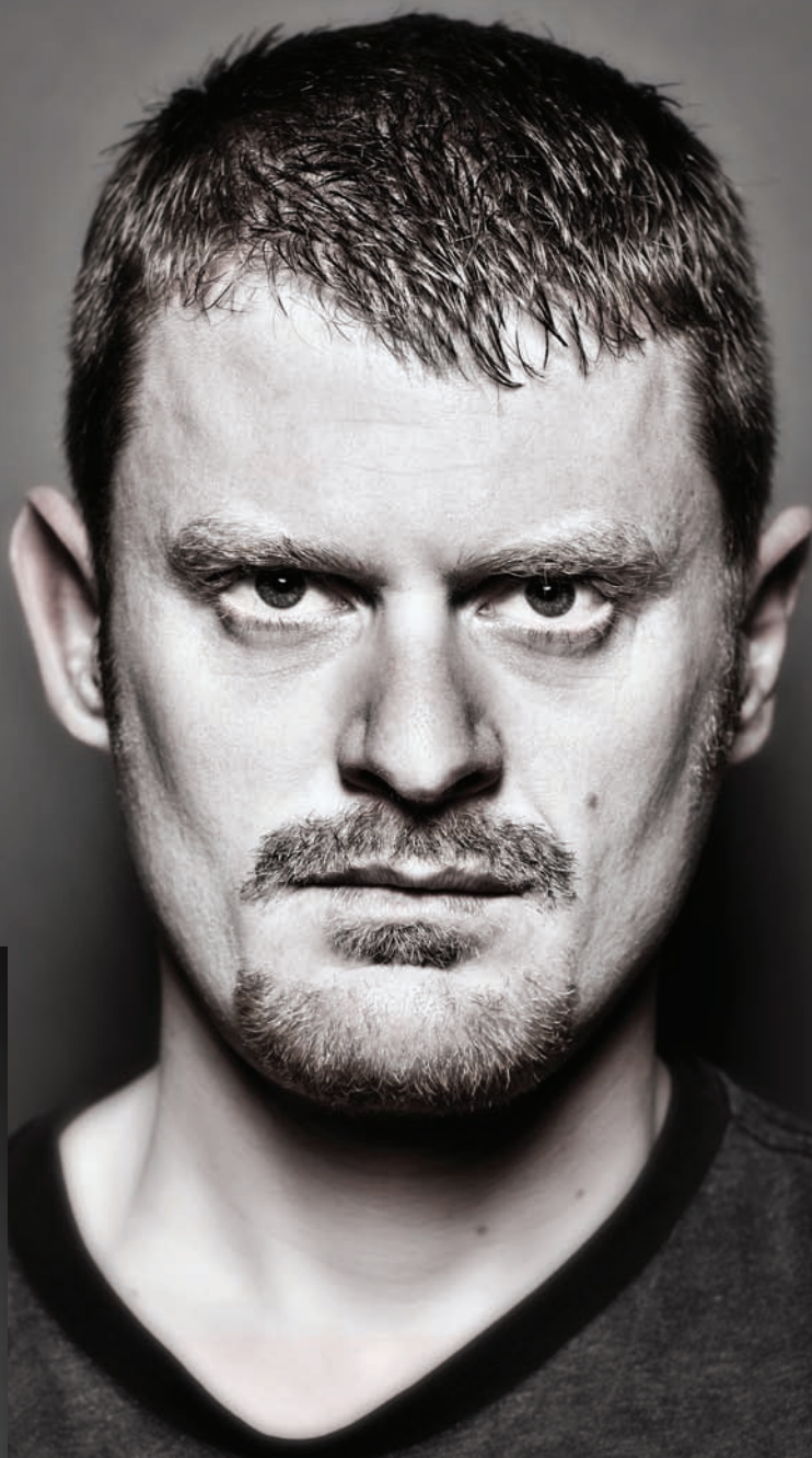
Floyd Landis San Diego, California Jan. '09